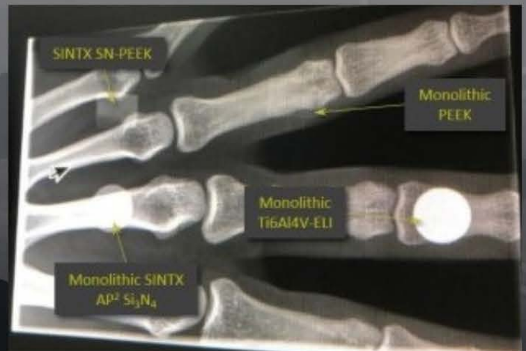
X-ray radiograph showing various biomaterials beneath a human hand as a demonstration of radiotranslucency (adapted from Pezzotti et al. 3 )